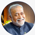
Shri Kamlesh D Patel Global Guide of Heartfulness